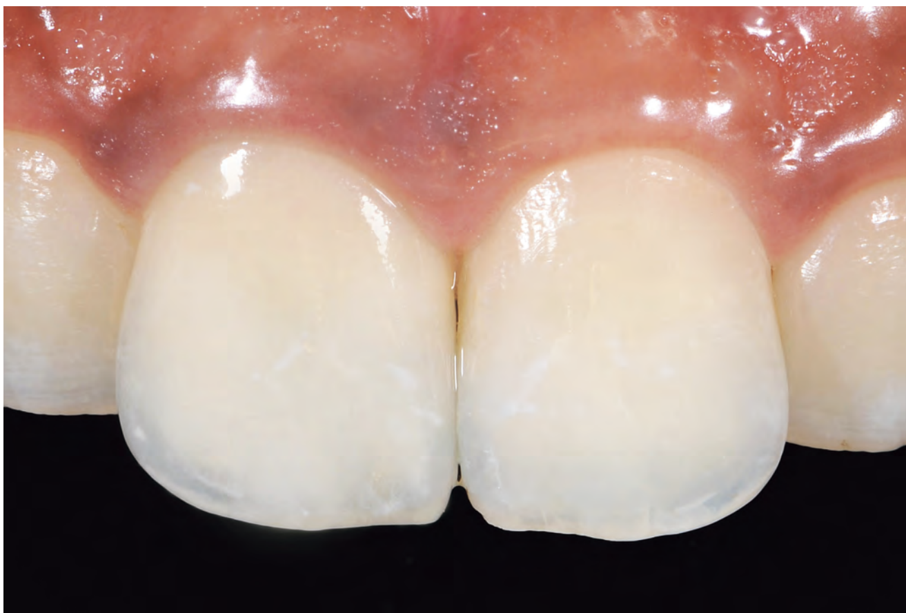
#8 IPS e.max Crown