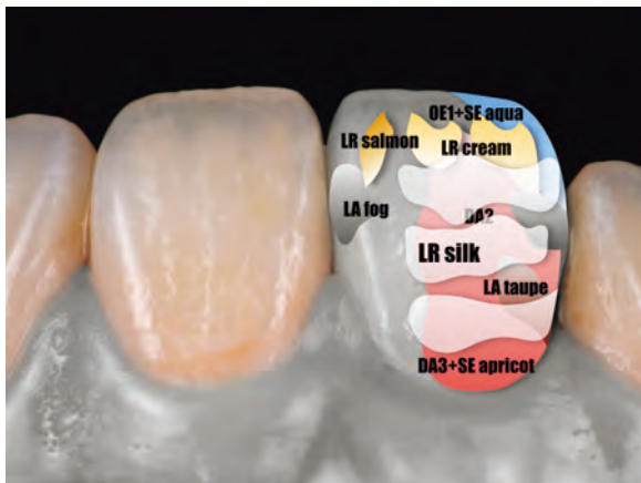
Internal Multi Layer